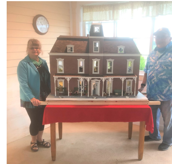
What a wonderful gift!!