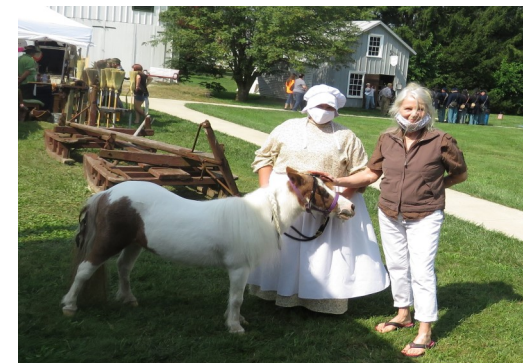
The Miniature Horses came to visit